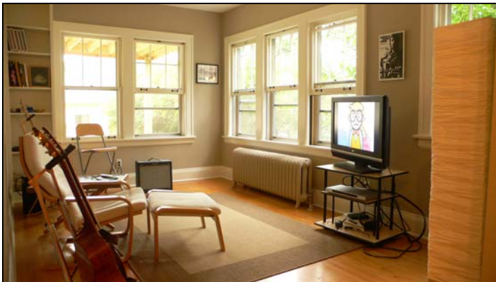
Sunny Corner Office/Library Room