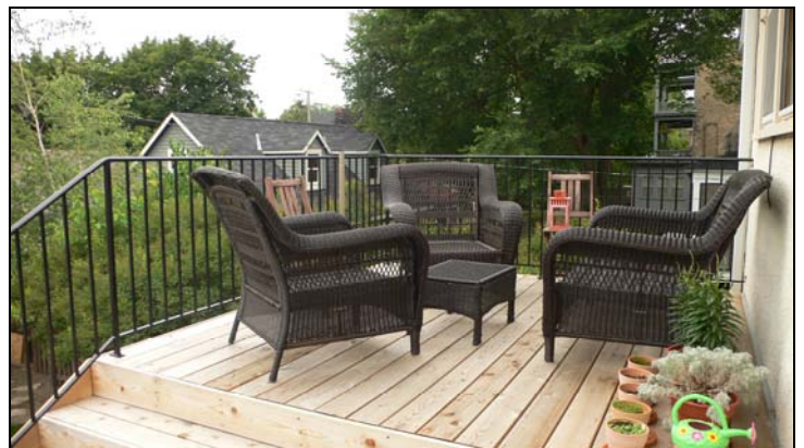
Brand New Upper Level Private Deck