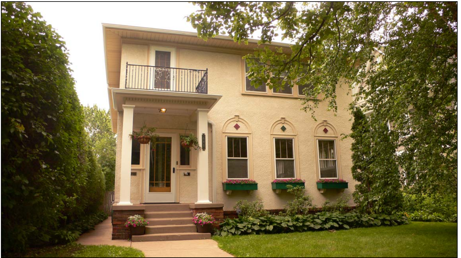
Crocus Hill Duplex. 648 Lincoln Avenue, St. Paul