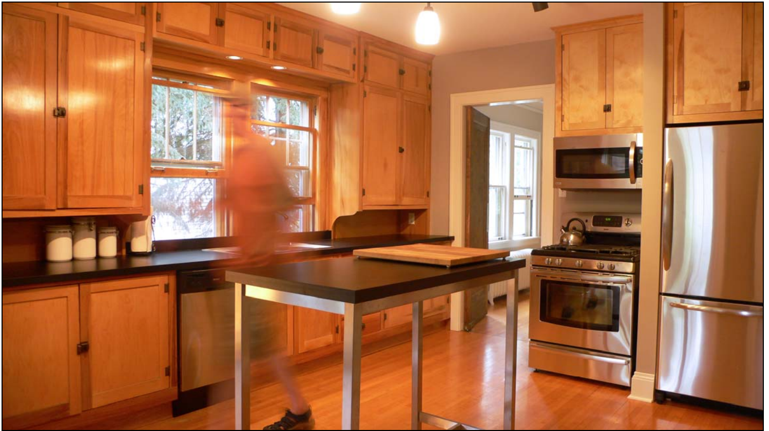
Completely Remodeled Kitchen on Main Level