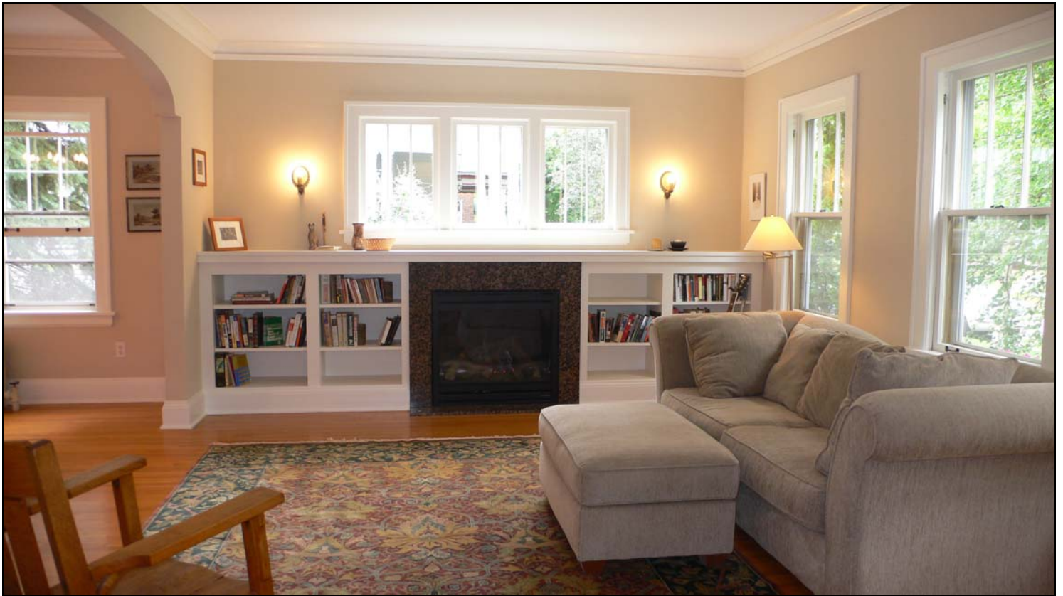
Custom Crafted Built-Ins and Gas Fireplace with Granite Surround