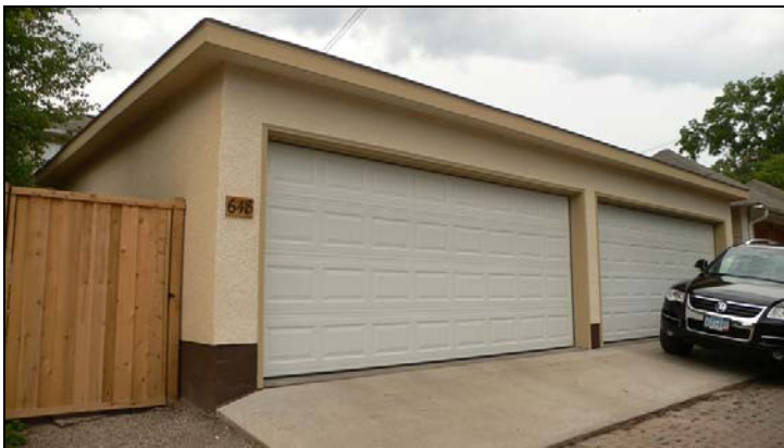
Brand New 4 Car Garage