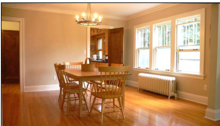
Separate Formal Dining Room with Chandelier