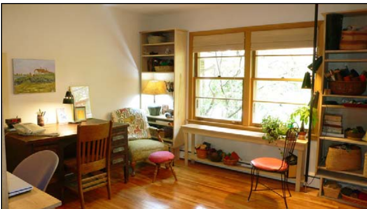
2 nd Bedroom/Office Space on Main Level