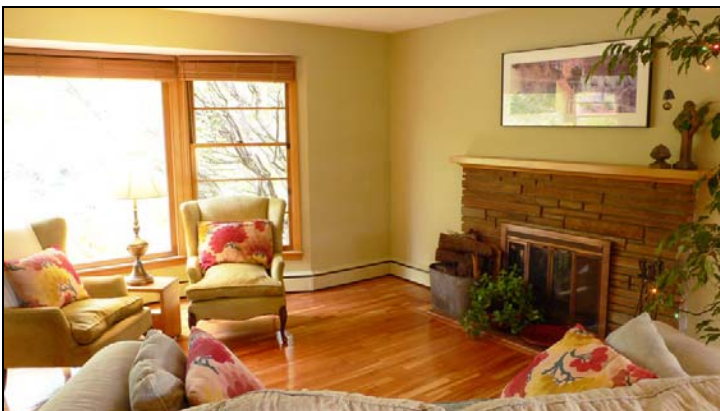
Fireplace & Hardwood Floors in Living Room