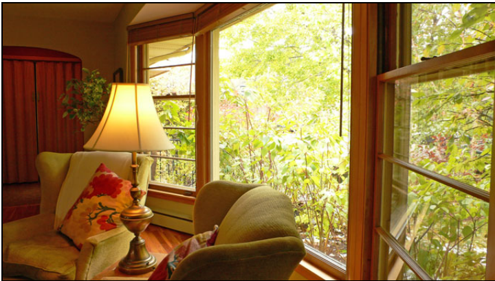
Oversized Bay Windows Bring the Outside In