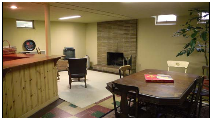
Large Finished Basement with Built-In Bar

Hoffman Parkin, Ltd. does not guarantee accuracy of square footage, room sizes, or other information concerning the condition or features provided by seller or obtained from public records or other sources. Buyer is advised to independently verify accuracy of that information through personal inspection & with appropriate professionals. All content herein, including images is property of Hoffman Parkin, Ltd. and may not be used without permission. Copyright © 2009 Hoffman Parkin, Ltd. All rights reserved.