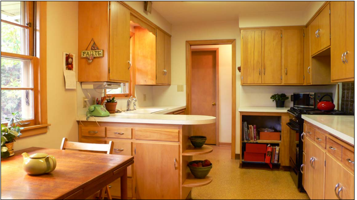
Sunny Kitchen with Breakfast Nook