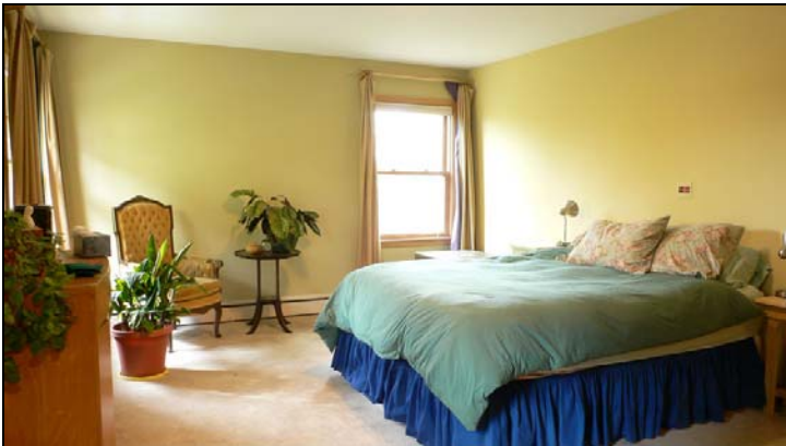
Large Master Suite with 2 Walk-in Closets