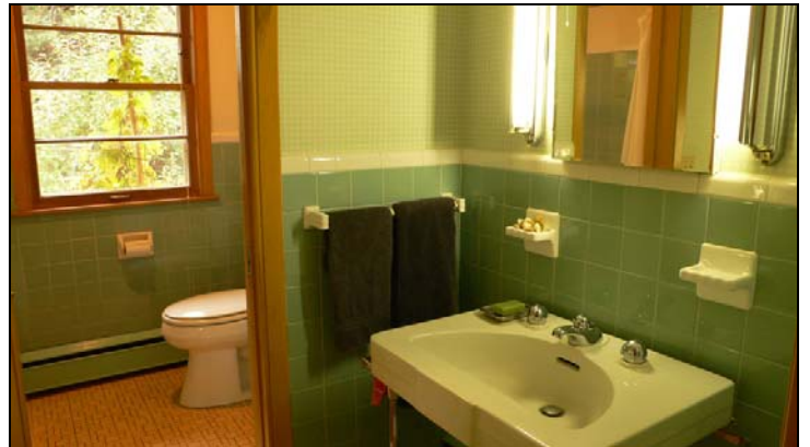
Charming Retro Bathroom with Great Colors