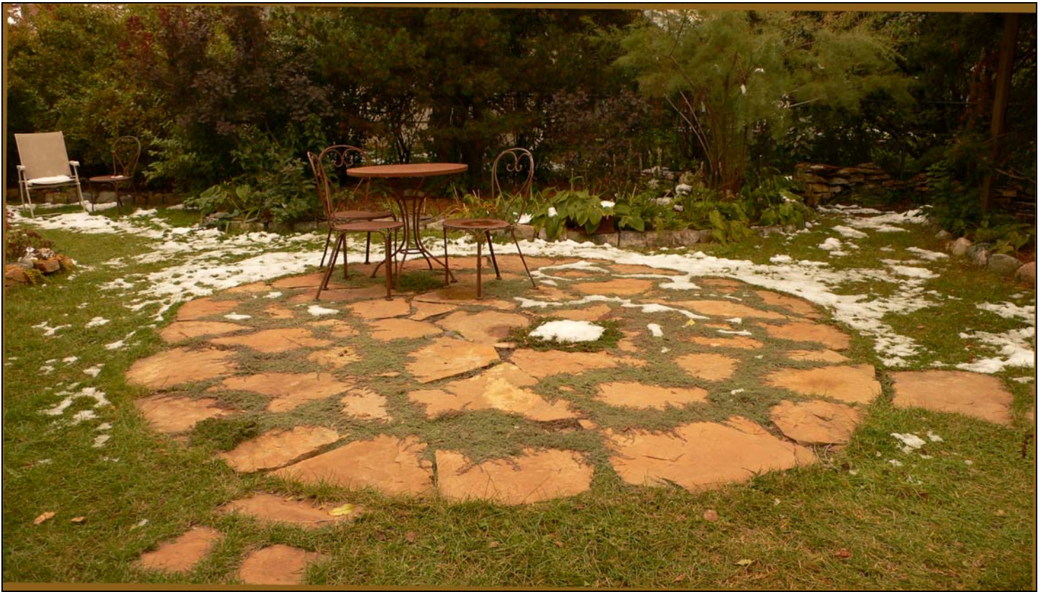
Back Yard is a Gardener's Paradise with Mature Plantings, Meandering Courtyards, and Hidden Spaces.