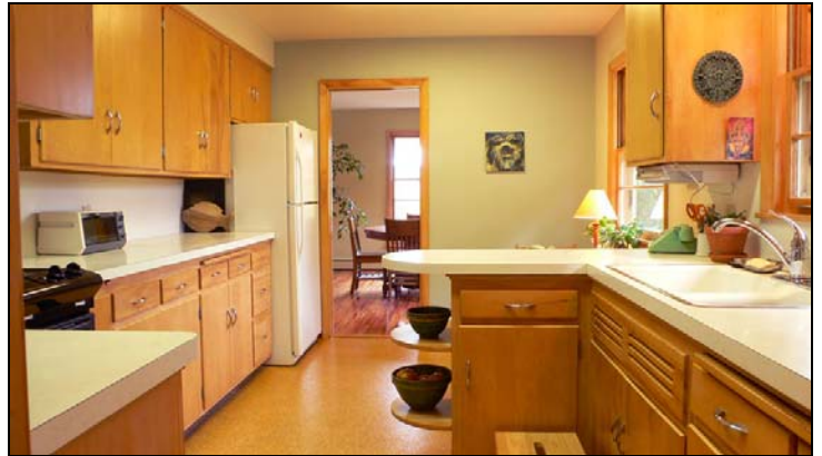
Kitchen Features Tons of Storage