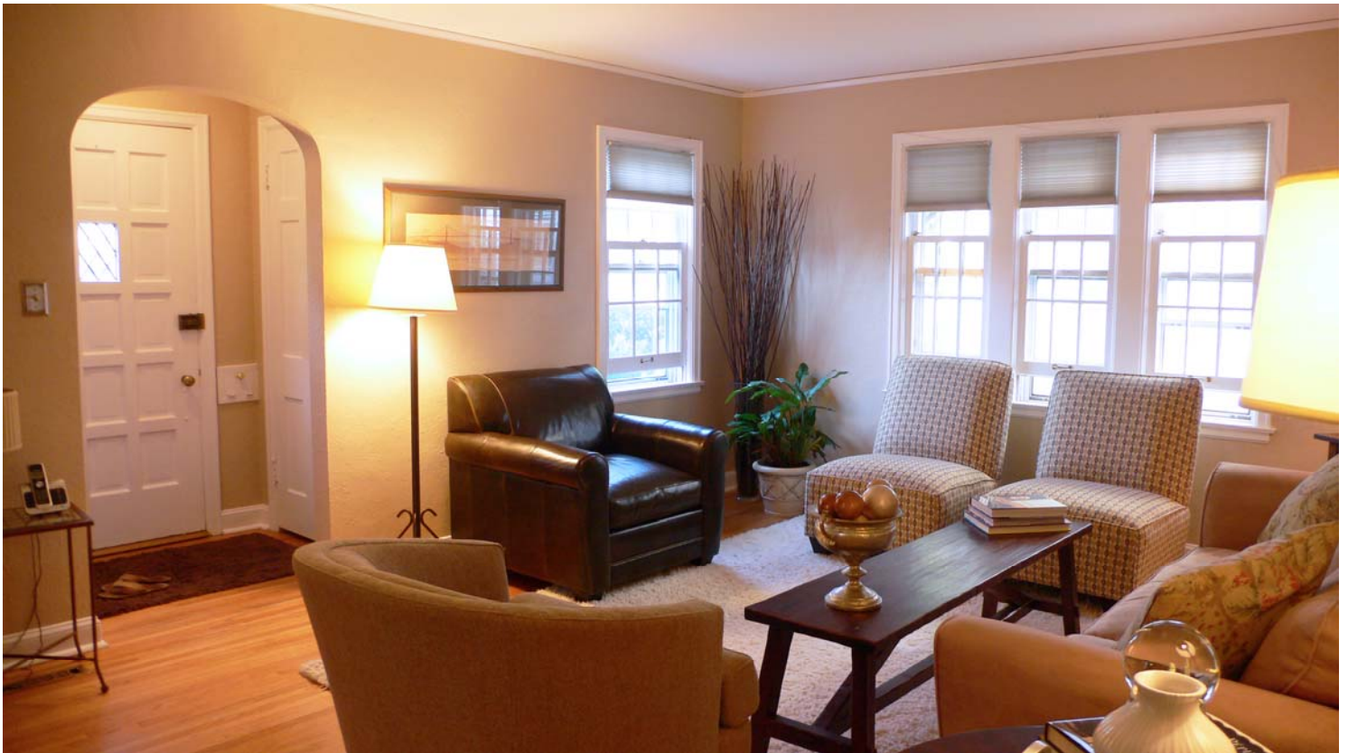
Dramatic Entrance to Living Room