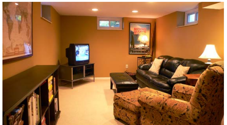
Cozy Family/Media Room in Finished Basement