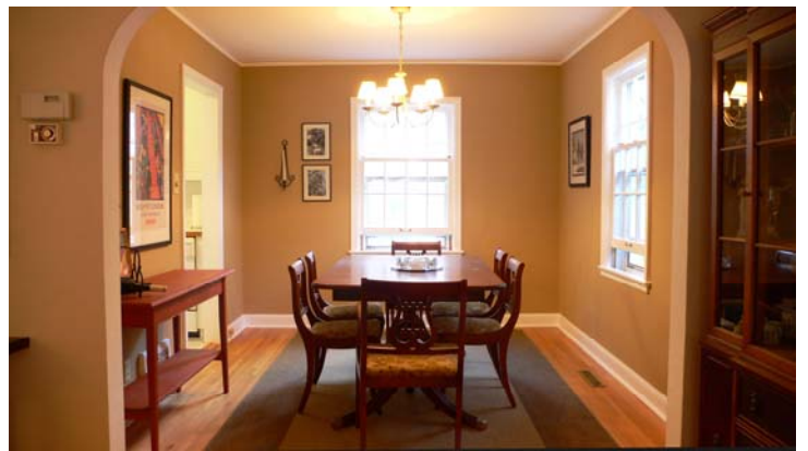
Elegant Formal Dining Room