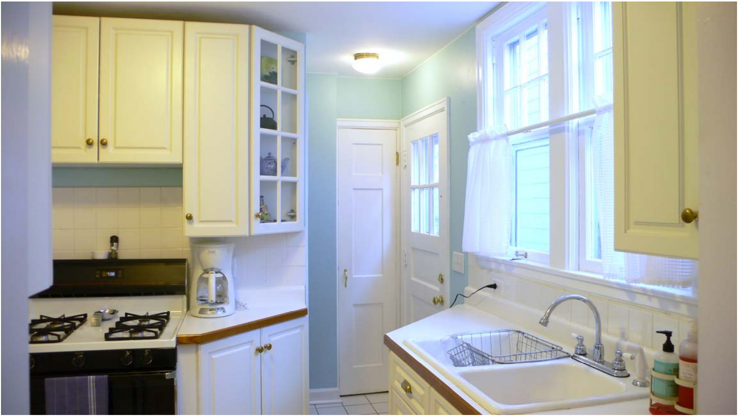
Fantastic Custom Kitchen with Updated Cabinetry