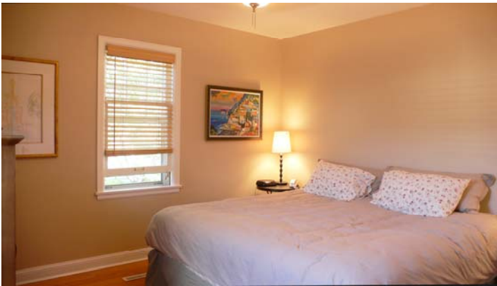
Master Bedroom on Main Level