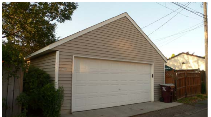
2 Car Garage