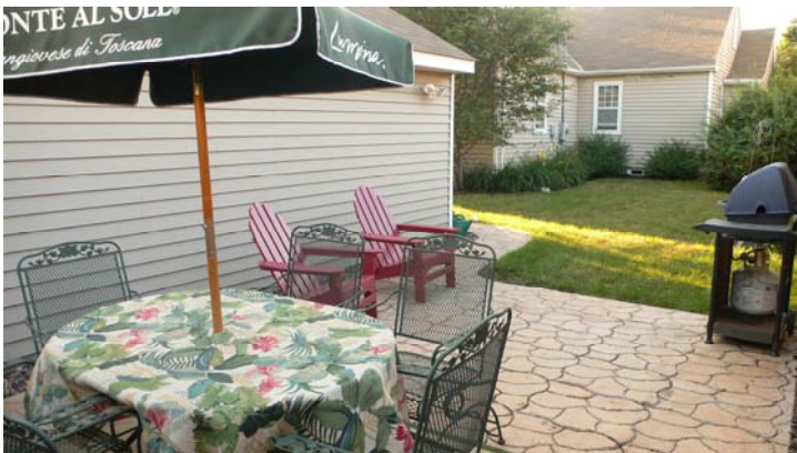
Huge Outdoor Patio for Grilling