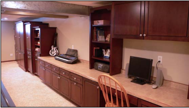
Amazing Built-in Office Space in Lower Level