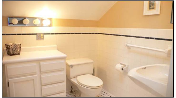
Beautifully Updated Bathrooms Throughout