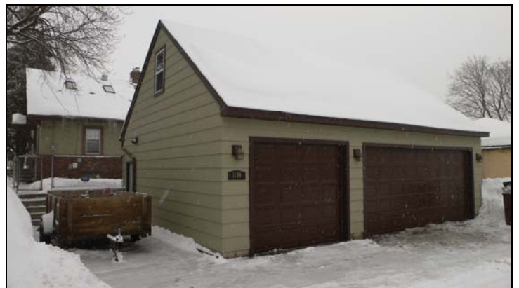
Two-Level Three Car "Garage-Mahal" with Storage