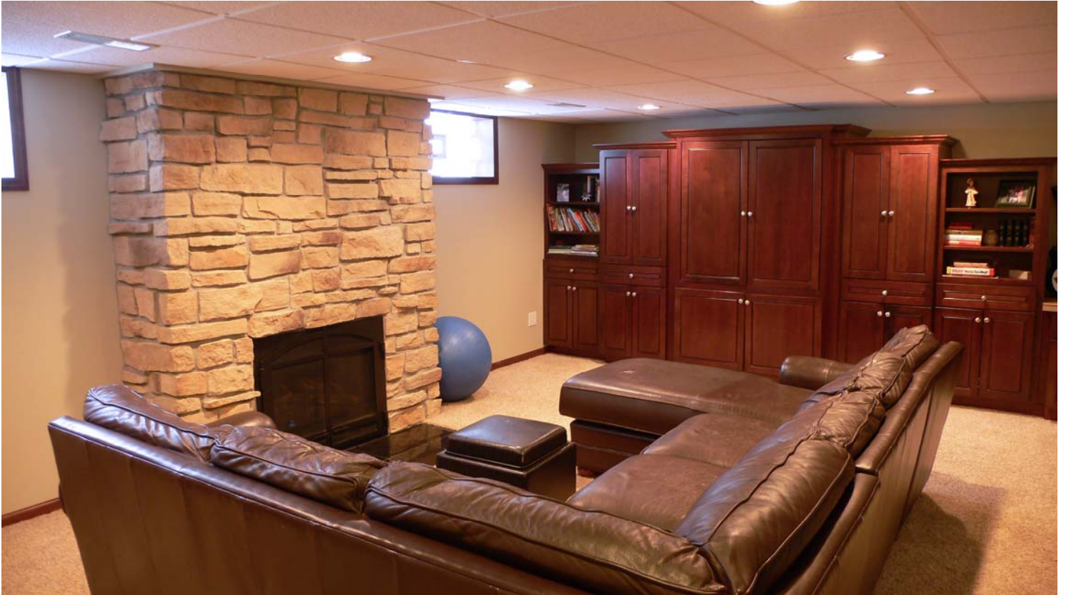
The Entertainment Center to End All Entertainment Centers