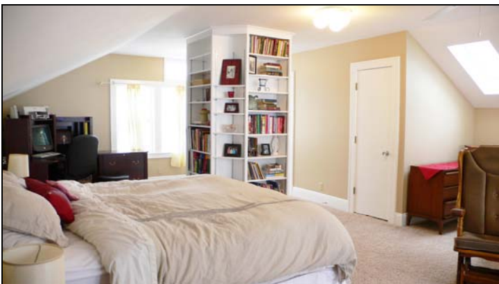
Huge Top-Level Master Suite with Skylights