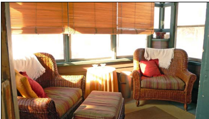
Sunny Entry Porch