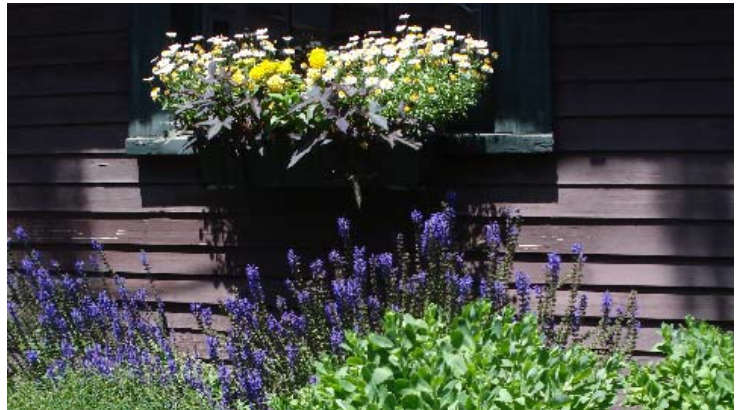
More Gorgeous Gardens!