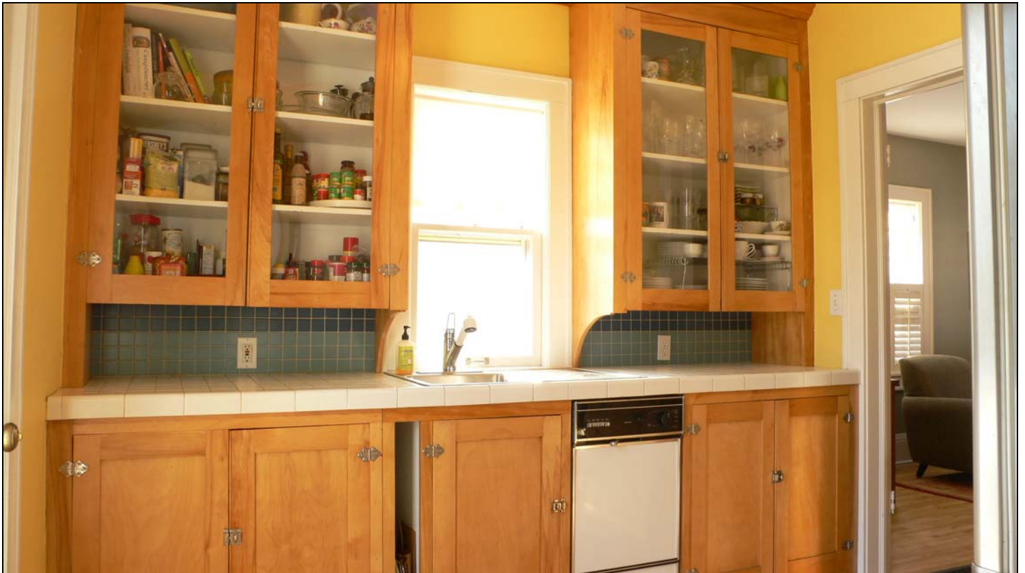
Charming Kitchen with Refinished Cabinetry.