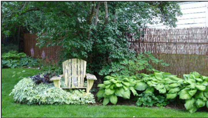
Beautifully Landscaped Backyard with Deck