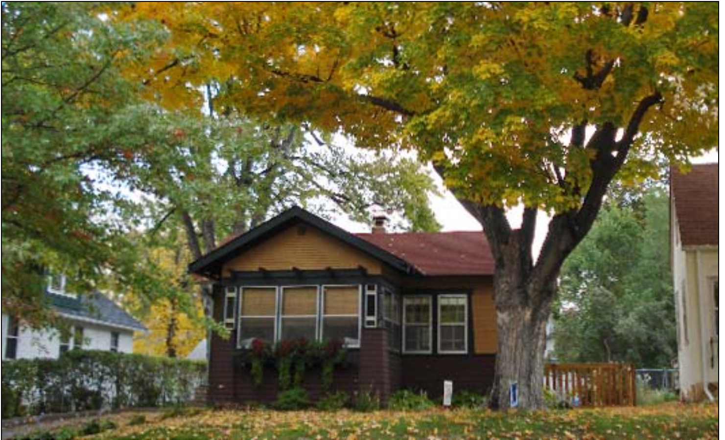
Cozy Craftsman Cottage 4317 10 th Ave S, Minneapolis